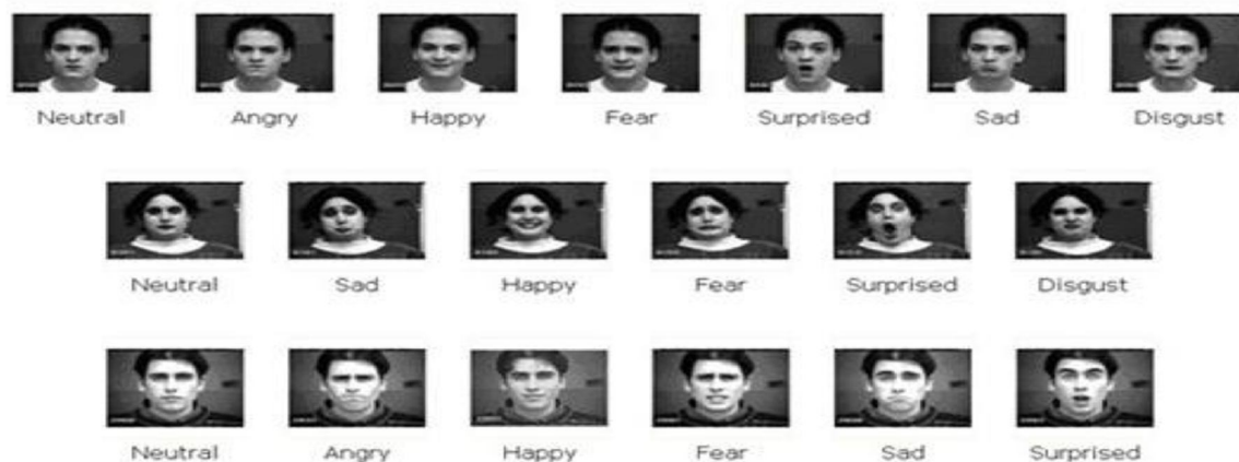
Figure 2. Images of Cohn-Kanade Database

Cohn-Kanade database is employed to get photographs of the various expressions posed by ninety-seven individuals. Images taken are around ninety-seven subjects and out of those subjects, the age is ranging between eighteen to thirty years. The database contains solely 35th of the male subject and therefore the remaining 65th are of the female. Out of this 15% is American- African subjects and three are enclosed from Asians. Capturing of the image was done using a camera and the lens kept in front of the subjects. the subjects were asked to perform completely different facial expressions beginning and ending with the neutral faces. The expression given by them covers all the fundamental six emotions. There are around 2000 pictures within which several of them are recurring thus we tend to not use the entire dataset to train the model. However, the dataset is helpful in providing us additional accuracy with the different facial expressions. This knowledge repository is used to train the model which is pictured as an internal system in RERS systemarchitecture. Images of Cohn-Kanade Database.