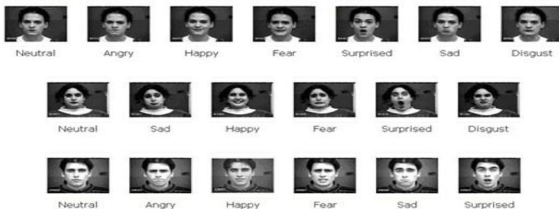
Figure 2. Images of Cohn-Kanade Database

Cohn-Kanade database is employed to get photographs of the various expressions posed by ninety-seven individuals. Images taken are around ninety-seven subjects and out of those subjects, the age is ranging between eighteen to thirty years. The database contains solely 35th of the male subject and therefore the remaining 65th are of the female. Out of this 15% is American- African subjects and three are enclosed from Asians. Capturing of the image was done using a camera and the lens kept in front of the subjects. the subjects were asked to perform completely different facial expressions beginning and ending with the neutral faces. The expression given by them covers all the fundamental six emotions. There are around 2000 pictures within which several of them are recurring thus we tend to not use the entire dataset to train the model. However, the dataset is helpful in providing us additional accuracy with the different facial expressions. This knowledge repository is used to train the model which is pictured as an internal system in RERS systemarchitecture. Images of Cohn-Kanade Database.