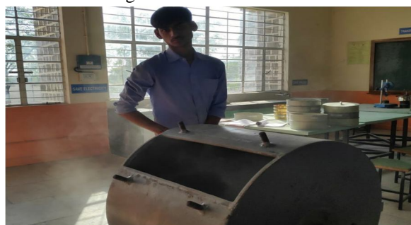
Figure 12 Los Angeles Abrasion test

Los Angeles Abrasion Test on aggregate is the measure of aggregate toughness and abrasion resistance such as crushing, degradation and disintegration. This test is carried out by AASHTO T 96 or ASTM C 131: Resistance to Degradation of small size coarse aggregate by abrasion and impact in the Los Angeles machine