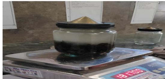
Figure9 Specific gravity test by Pycnometer

Specific gravity test by Pycnometer the Pycnometer is used for determination of specific gravity of aggregate. The determination of specific gravity of aggregate will help in the calculation of void ratio, degree of saturation and other different aggregate properties.