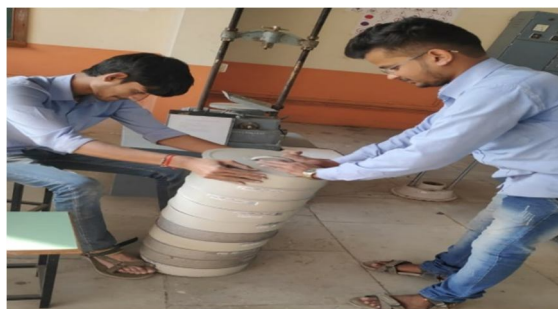
Figure11 Sieve Analysis Test

A sieve analysis is a procedure to use to assess the particle size distribution of a granular material by allowing the material to pass through a series of sieves of progressively smaller mesh size and weighing the amount of material that is stopped by each sieve as fraction the whole mass.