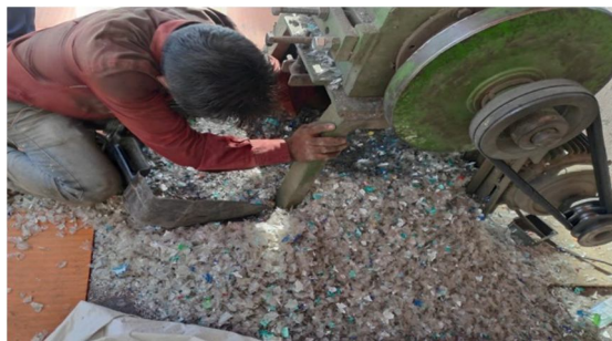
Figure5 Waste plastic bottles crush