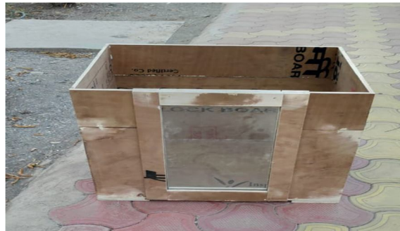
Figure 4 Model of Permeable Pavement