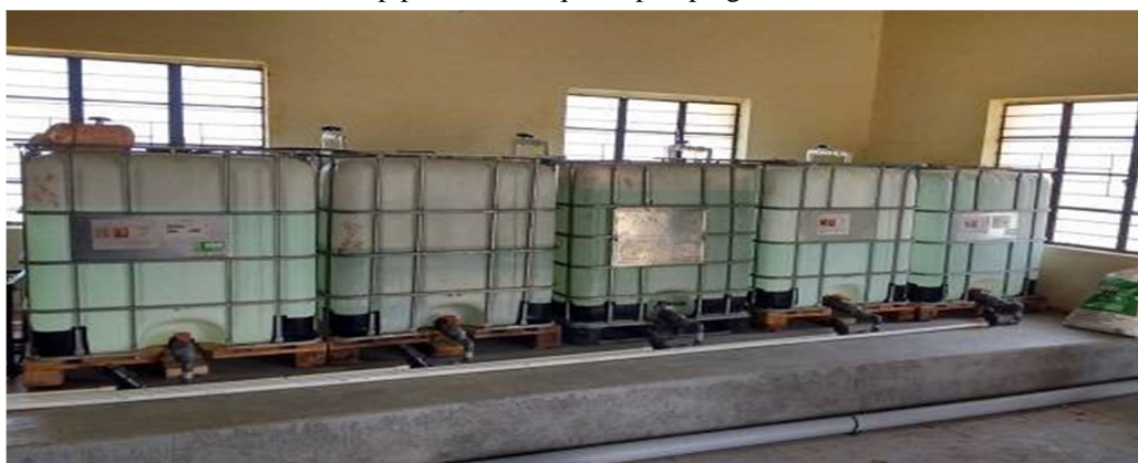
Fig-3:Fertilizer TankThe steps needed to be followed for designing the Micro irrigation system are given below

The planning and design of drip irrigation system is essential to supply the required amount of irrigation water. The water requirement of the plant per day depends on the water that is taken by the plant from the soil and the amount of water evaporating from the soil in the immediate vicinity of the root zone in a day. The plant intake is affected by the leaf area, stage of growth, climate, soil conditions etc. The water requirement and irrigation schedule can be determined from the soil or plant indicators based methods or soil water budget method, but the simplest and most commonly method is to use pan evaporimeter data. To apply the required amount of water uniformly to all the plants in the field, it is essential to design the system to maintain desired hydraulic pressure in the pipe network. The design of Microirrigation system is essentially a decision regarding selection of emitters, laterals and manifolds, sub main, main pipeline and required pumping unit.