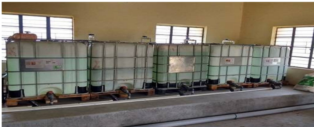
Fig-3:Fertilizer TankThe steps needed to be followed for designing the Micro irrigation system are given below

The planning and design of drip irrigation system is essential to supply the required amount of irrigation water. The water requirement of the plant per day depends on the water that is taken by the plant from the soil and the amount of water evaporating from the soil in the immediate vicinity of the root zone in a day. The plant intake is affected by the leaf area, stage of growth, climate, soil conditions etc. The water requirement and irrigation schedule can be determined from the soil or plant indicators based methods or soil water budget method, but the simplest and most commonly method is to use pan evaporimeter data. To apply the required amount of water uniformly to all the plants in the field, it is essential to design the system to maintain desired hydraulic pressure in the pipe network. The design of Microirrigation system is essentially a decision regarding selection of emitters, laterals and manifolds, sub main, main pipeline and required pumping unit.