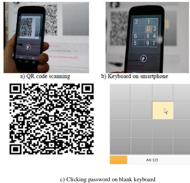
Fig. 4. Shows the expected outcomes of the authentication protocols, (a) shows the QR code scanning at the terminal using smartphone. (b) shows the encoded keyboard layout on the smartphone with the random arrangements of digits. (c) shows the blank keyboard layout at the terminal which is prompting to click the password.