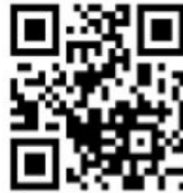
Fig. 3. QR code

At first, the QR code has been designed to be used in automotive industries. But now, it has been widely used in the advertisement so that a client can use the smartphone and scan to know more information about the advertised products. The barcode scanner applications are created which is compatible for smartphones like android and ios.