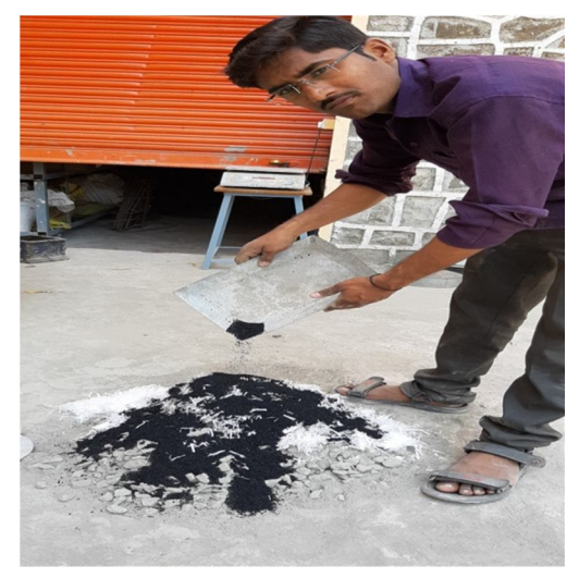
Fig(f): Addition of treated Crumb Rubber and Synthetic Fibre in concrete.

It is an effective treatment method for making a homogenous mixture, that rubber particles are evenly distribute. Also, this method results in the formation of better bond between rubber and cement paste in concrete. The major problem associated with the direct addition of rubber into the concrete mixture is the tendency of rubber particles to trap air bubbles, which are clinging to them. During the period of 24 h of water-soaking the trapped air bubbles, which are attached to rubber particles can get enough time to release gradually and the observed rubber hydrophobic behaviour can significantly be resolved. It was observed that just after addition of rubber to the container of water most of the particles (roughly over 50% of rubber particles) were floating on water, but gradually after 24 hrs. most of them were sunk to the bottom of the container. The mixture of rubber and water is full of air bubbles; however, after 24 h most of the entrapped air bubbles were released from the mixture. In addition, stirring the mixture of rubber and water facilitated releasing of the entrapped air bubbles to be detached and release from the mixture.