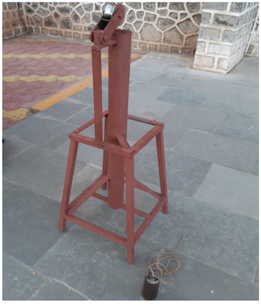
Fig(a): Impact Test Apparatus