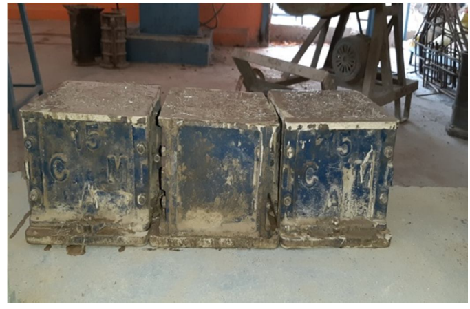
Fig(d): Casting of cubes for compressive strength test at the age of 7 days

With the constant water-cement ratio, the compressive strength showed a decreasing trend when percentage of crumb rubber increased. This loss in strength is mainly due to lack of adhesion between rubber particals and cement paste.