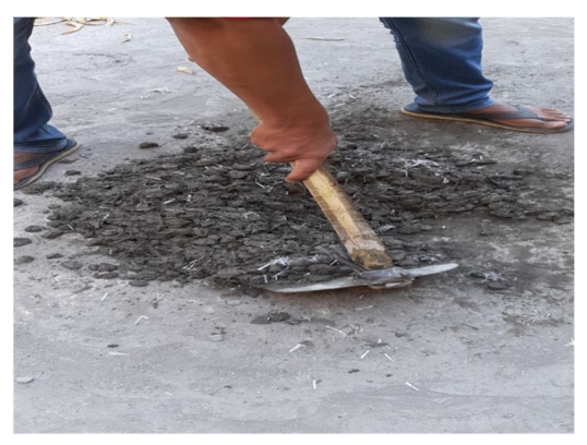
Fig.(g): Mixing of materials