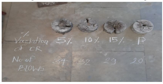
Fig (b): No. of blows at the age of 7 days

To study the impact strength of concrete circular disc specimen of size150 mm diameter and 50mm depth were cast and test was conducted after 28 days of curing by using drop weight impact test equipment. Circular disc specimen mould of 150mmø with a depth 50mm was made from PVC pipes. The moulds were placed over hard platform and concrete mix was filled in the mould with proper compaction. After 24 hours specimens were demoulded and kept in curing tank for 7 days and 28 days.