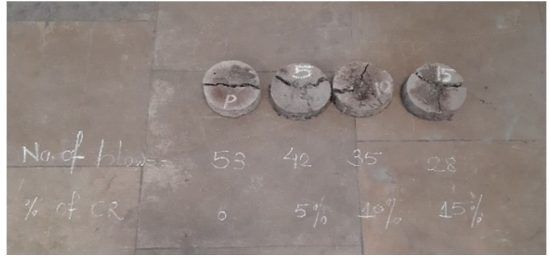
Fig (c): No. of blows at the age of 28 days

Volume 7 Issue V, May 2019- Available at www.ijraset.com