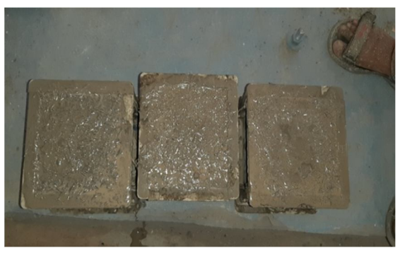
Fig(e): Casting of cubes for compressive strength test at the age of 28 days.