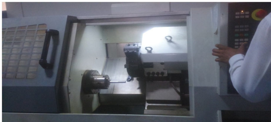
Fig. 1 Setup of EN-24 specimen for experiments on CNC Turning Machine

Experiments are conducted on SIEMENS CNC TURNING MACHINE. The machine is as shown in the figure below. The material is removed from the work-piece by the linear motion of tool towards work-piece in form of chips. The machine setup is shown in figure 1. The material used for this work is EN 24. The bar of workpiece was of 20mm diameter. The tool material used for this work is HSS.