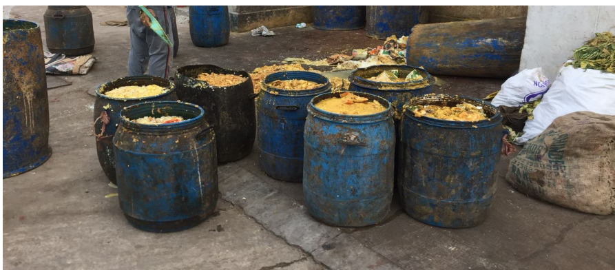
Figure-1 Biodegradable waste

The biodegradable waste disposer provides assistance in the direction of waste decomposition. The unit provides various advantages as compared to the currently used decomposition methods. The unit is easy to install as well as easy to operate. It does not require any skill for the decomposition of the waste so even an illiterate person can operate it. One of the major benefits of this unit is that there is no need to accumulate a waste at a particular place and transfer it to the plant where it is decomposed so that the use of dumping sites reduces. The motivation for this project came into mind as we look around in our society. The waste of the university and our society is not disposed properly. The management of Municipal Corporation fails to dispose waste in an efficient way. Like any other educational institute, colonies, firms and societies our university produces a large amount of biodegradable waste including residual food from mess and canteen, residuals of vegetables and leaves. This waste is not disposed properly and causes foul smell and various diseases. Thus this waste needs to be disposed so the idea of making a waste disposer is generated.