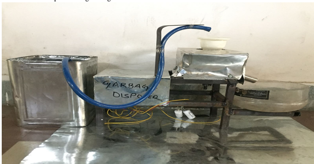
Figure-3 Final Prototype

Basic structure for supporting this model is made of cast iron because cast iron has a good compressive strength. The frame is welded together to make a rigid structure. After that other components are welded on the frame with the help of arc welding. The shredder includes a food conveying section, a motor section, and a grinding mechanism disposed between the food conveying section and the motor section. The food conveying section includes a housing that forms an inlet for receiving food waste and water. The food conveying section conveys the food waste to the grinding mechanism, and the motor section includes a motor imparting rotational movement to a motor shaft to operate the grinding mechanism.