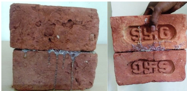
Adhesive property of mix