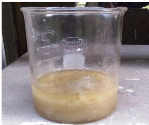
Mix prepared by mixing Petrol and Thermocol