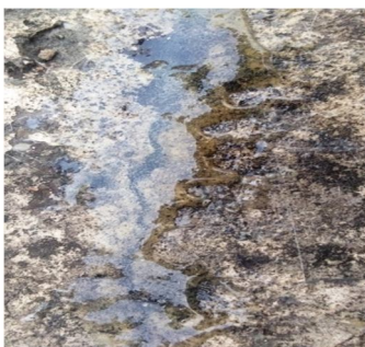
Applying the mix

After 1-2 days of proper sunlight this type of harden plastic form on the harden concrete surface