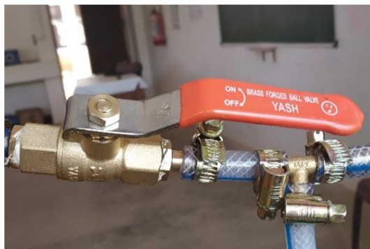
Fig 4 Valves

There are 2 types of valves used such as two way valves and single way valves and it is made from Brass –chromium.