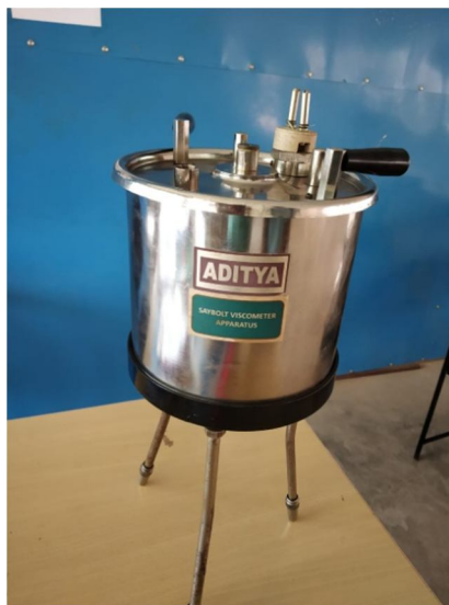
Fig 13: Saybolt Viscometer apparatus