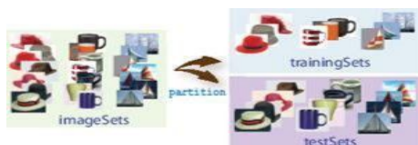
Fig 2. Image set containing Test Sets

Using drone pictures are taken and the processing methods used on those images are explained in this section. MATLAB is software that has been used and exploited over and over again for its feasibility and the availability of abundant number of packages that come by default with it. In this paper Computer Vision System Toolbox is utilized extensively to implement pattern and machine learning algorithms for classification of images. Matlab-1016b is used as it has few inbuilt functions that the previous versions did not consist of. Bag of visual words are created for image category arrangement utilizing the Computer Vision System Toolbox. Computer Vision System Toolbox is used to create Bag of visual words to classify images categories. Visual words histogram is produced which is used to train an image category for classification. Following steps are followed to setup the images, generate a bag of visual words, and then to train and test an image category classified.