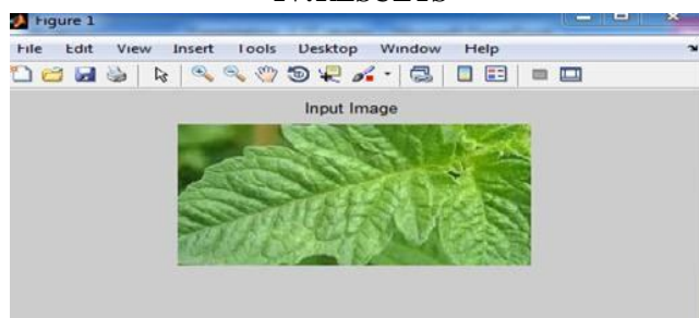
Fig 3. Input Image