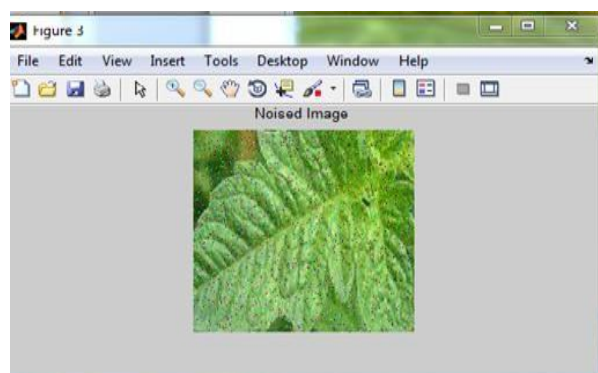
Fig 5. Noised Image