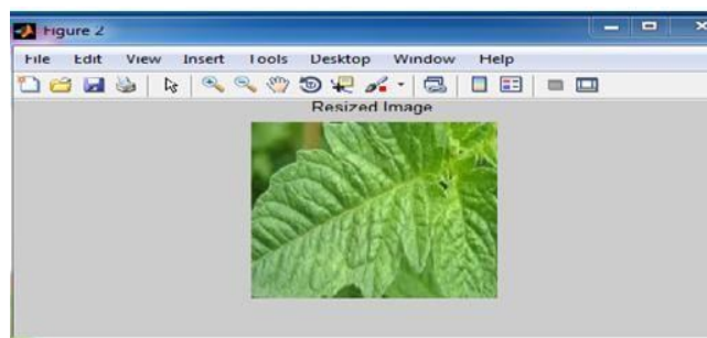
Fig 4. Resized Image