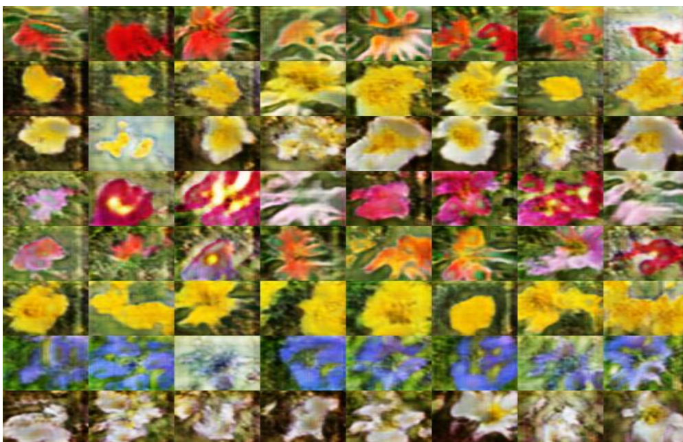
Figure 2: Epoch-50-Flowers