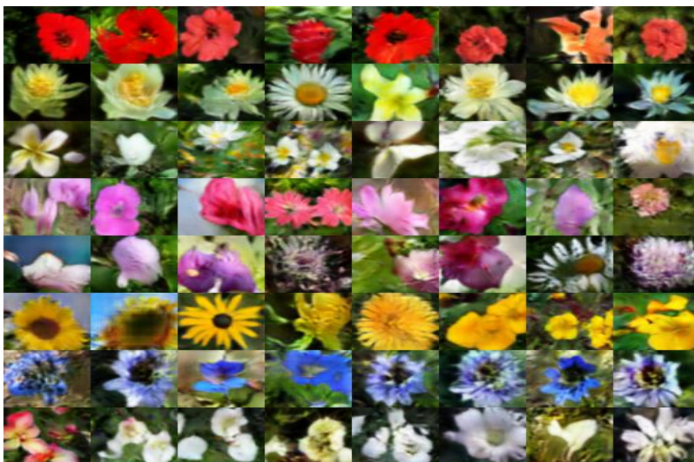
Figure 4: Epoch-599-Flowers