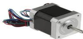
Fig. 2.1.1: stepper motor