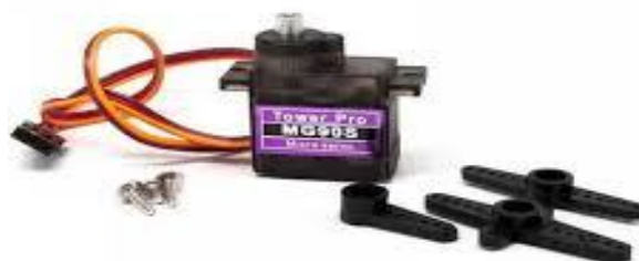
Fig 2.1.2 Servo motor