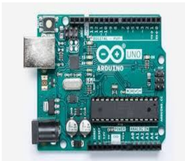
Fig.2.1.2Arduino Uno R3