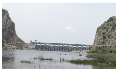
Figure 3: Broad view of Bisalpur Dam