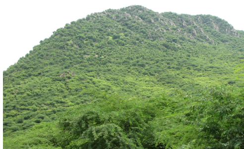
Figure 4: Flora at study area