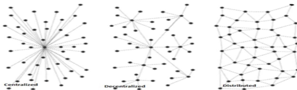
Fig 2: Centralized, Decentralized, and Distributed Network

This network is not as a centralized architecture. all the nodes participate in the computation of the information sharing process. they coordinate with each other and collectively share the information among them. Centralized platform good but not scalable they are not robust to failure[9].