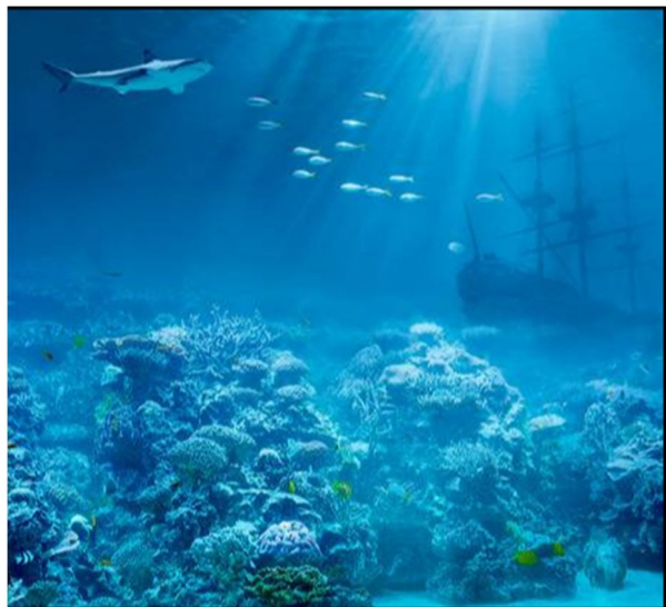
Figure 2: Source image

The results have obtained for guided filtering algorithm which shows the smoothness in an image and the edge factors that has been preserved. Figure 2 and figure 3 shows the results of guided filtering algorithm. The image gets converted into gray image to get the more detailed factors and the results are obtained as follows.