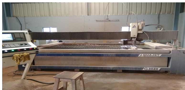
Fig: 1 Abrasive Water jet machining Process Setup

Aquajet abrasive water jet machine G3020 with CNC Water jet Cutting machine, HP pump & accessories with highest quality Tool design and manufacture water jet cutting machine with an exposure to German Engineering were shown in fig.1 and specifications of AWJM were Table.1