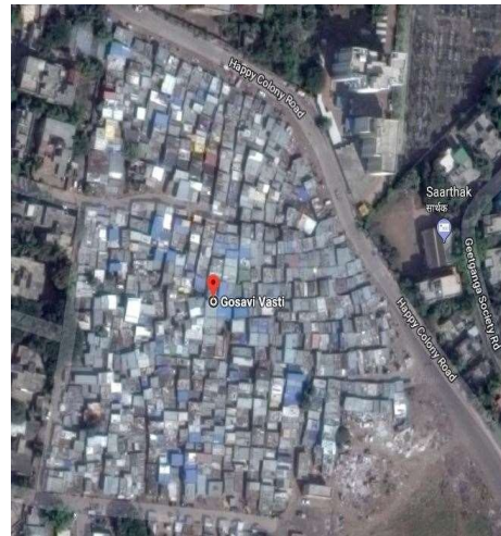
Fig. 5 Gosavi Vasti Satellite image.