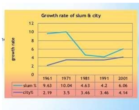
Fig. 3 Growth Rate of slum and City.

The case study chosen for this study would be a one of the slums from Pune City, Maharashtra. The primary reason for this being that Pune is a metropolitan region, and hence the number of slums is greater here. In the statistics stated above, it was seen that Pune had about 33% of the urban population living in slums. Below are a few images that show the seriousness of the problem of slums in Pune.