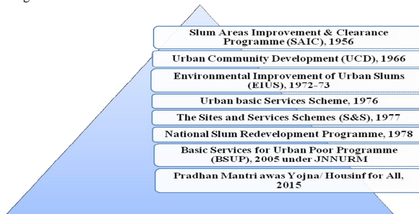
Fig. 2 Slum Related Schemes in India.

These schemes are stated in the figure below: