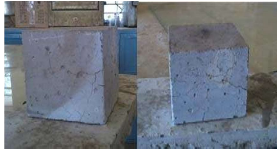
Fig. 4.2: Concrete specimens subjected to 900°C

In general, the normal concrete mixes usually have high paste to aggregate content compared to fire resistant strength. Therefore, additional loss of strength in normal concrete is also because of occurrence of small cracking because of thermal incompatibility of hardened cement past and aggregates. In case of fire resistant concrete increase in strength was determined at 300°C, there is also intensifying association with temperature to 300°C. This method is similar to the strength increase behaviour usually determined in steam curing.