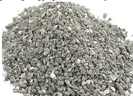
Fig.5.4.1: Carbonate Aggregate for Concrete

Aggregate occupy about 60-70% of volume of concrete, so aggregate properties considerably influence the performance of concrete during fire. There are three common types of aggregated used to produce concrete namely carbonate like limestone, siliceous such as granite and sandstone and lightweight aggregates such as expanded clay and ceramist sand.