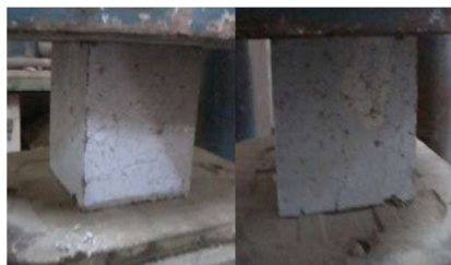
Fig. 4.1: Concrete specimens subjected to 300°C and 600°C

There is a reduction in compressive strength with temperatures of exposure. The reduction in compressive strength with temperature occurred for each normal concrete and fire resistant concrete. the average loss in strength in M20 grade concrete is about 7.4%, 12%, 19.8%, and 43.5% at, 300°C, 600°C, 900°C and 1003°C respectively, whereas concrete of M20 grade for fire resistant concrete has shown a loss in strength of 5.2%, 7.9%, 14.8%, and 31.6% at 300°C, 600°C, 900°C and 1003°C respectively.