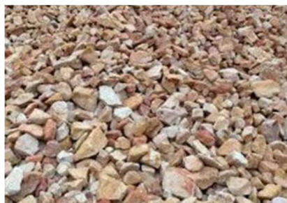
Fig.5.4.2: Sandstone Aggregate