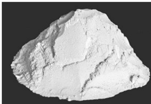
Fig.5.5.2: Silica Fume for Fire Resistance of Concrete