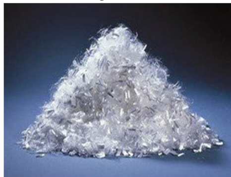
Fig.5.6.3: Polypropylene Fiber to Increase Fire Resistance of Concrete

So, it can be said that the addition of fibers would enhance the performance of concrete subjected to fire.