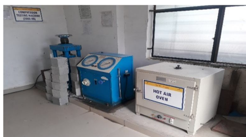
Fig.5.7: Equipment- CTM & Electric Furnace