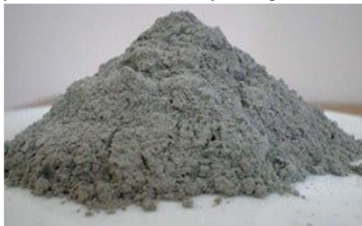
Fig.5.5.1: Fly Ash for Fire Resistance of Concrete

Additionally, supplementary materials would increase the resistance of concrete to spalling during fire. Unlike other supplementary materials, silica fume would outperform by normal concrete when they are exposed to the same degree of fire.