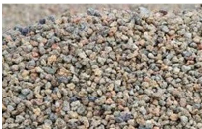
Fig.5.4.3: Lightweight Aggregate

The performance of concrete made from each type of aggregate is different due to properties of these aggregates.