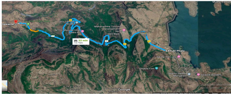
Fig.1 Satellite imagery of study area