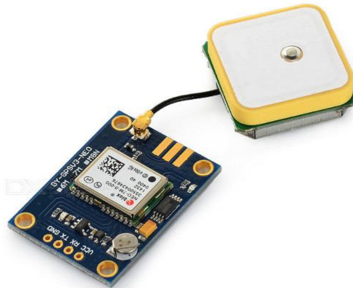
Fig: Ublox Neo 6-M GPS

For detecting the current location of blind person GPS module is used. When the blind person wants to go places, the GPS module will give the direction to go to the places. For communication purpose Ublox NEO-6M GPS Module is used. The module series is a family stand-alone GPS receiver featuring the high performance Ublox 6 positioning engine. It is dynamically flexible, user friendly and cost-effective receiver. It offers numerous connectivity options in a miniature 16 x 12.2 x 2.4 mm package. There compact architecture and power and memory option make neo 6 modules ideal for battery operated mobile devices with very strict cost and space constraints.