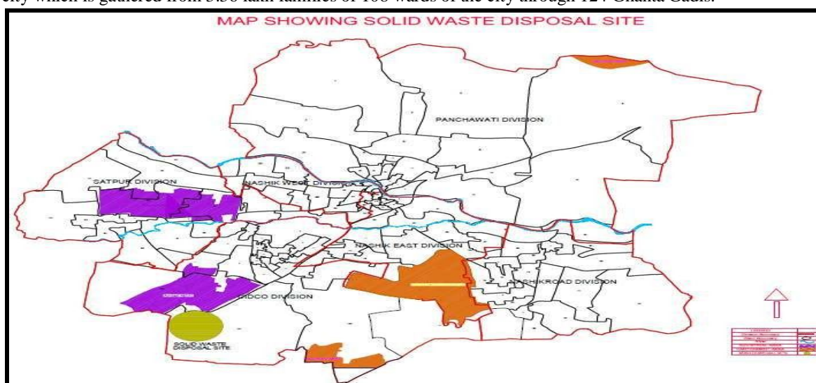
Fig. 1. Study Area With Solid Waste Disposal Site

The ongoing examination of strong waste parts gathered inside the NMC region uncovers that 37.8% are effectively compostable (transient biodegradable) materials, 19.50% are hard lignite materials (long haul biodegradable) while 16.20% are a combination of materials, plastic, elastic, and so on (source: DPR on SWM, NMC,2007). Nashik has a Municipal Solid Waste (MSW) office set up at Khat prakalpa that has an assortment of handling units. Strong waste is gathered each day or in given calendar for certain wards or parts of city which is gathered from 3.36 lakh families of 108 wards of the city through 124 Ghanta Gadis.