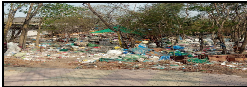
Fig.2. Throwing trash on open land

Examination of city waste completed as of late, uncovers 37.8% effectively compostable (momentary biodegradable) materials, 19.50% hard lignite and long haul biodegradables and 16.20% materials, plastic, elastic and so forth. These last two parts having 35.70% substance in the MSW have turned into a noteworthy reason for concern. These materials are a negative supporter of the preparing plant productivity and quickly exhaust accessible land for land-filling.