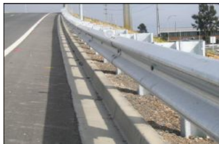
Fig. no 4