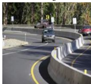
Fig. no 5