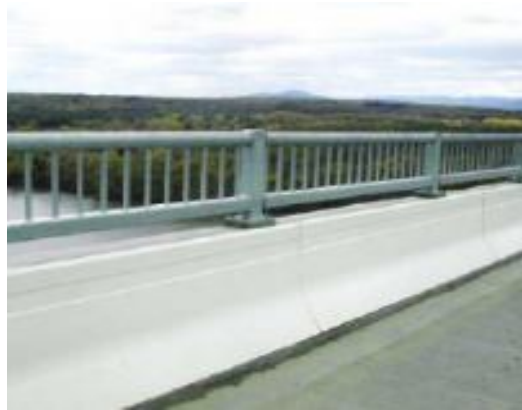
Fig. no 6