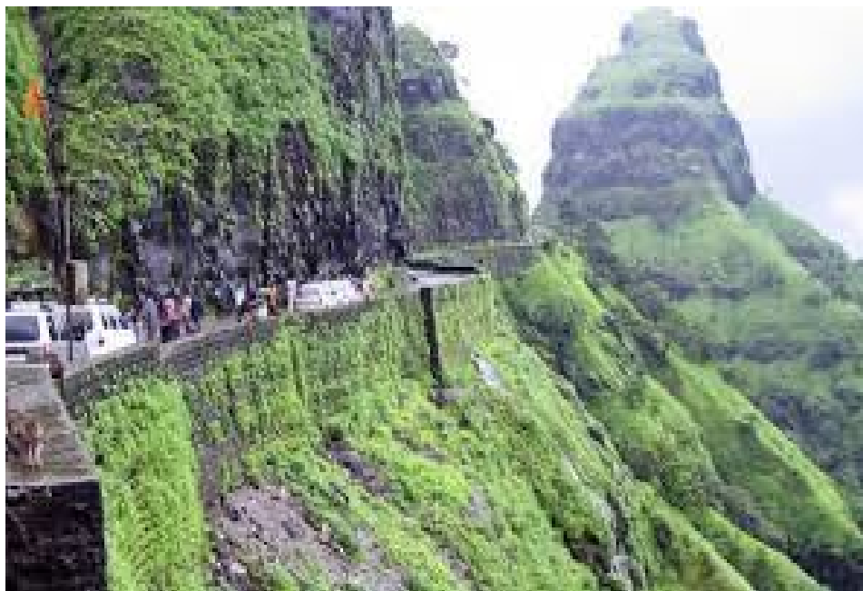
Fig no.2 Curve Section of Bhor Ghat