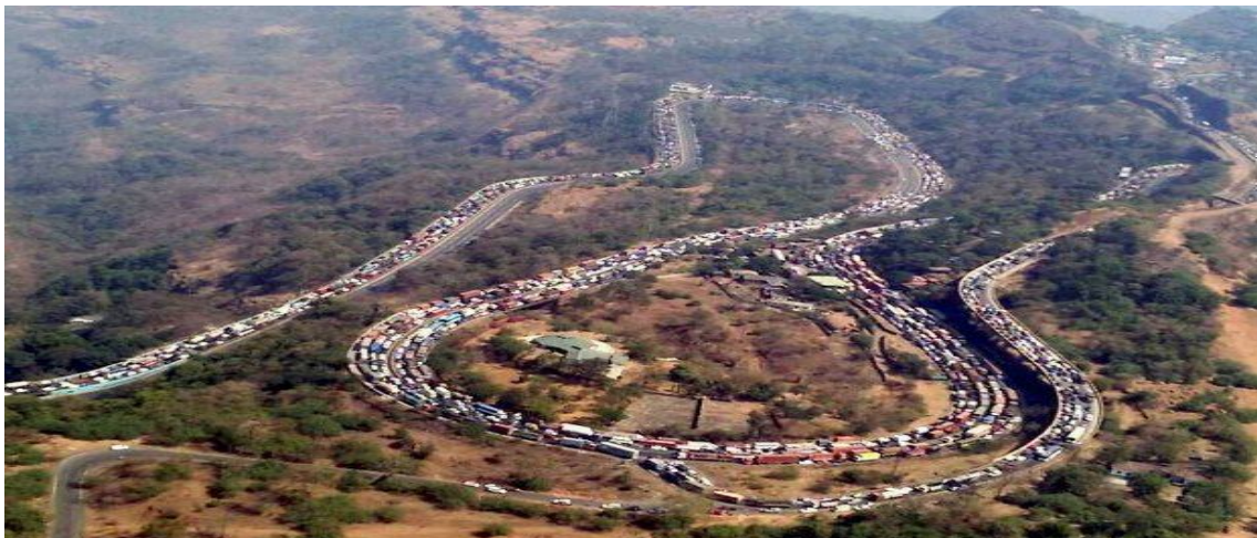
Fig no.1 Top View of Bhor Ghat

For the study purpose bhorghat has been selected. The elevation of bhorghat is 622 metres and 2041ft in depth. It is located between khopoli and khandala.