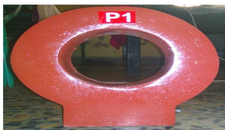
Fig.1 Photograph of experimental set up