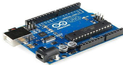
Figure: Arduino uno