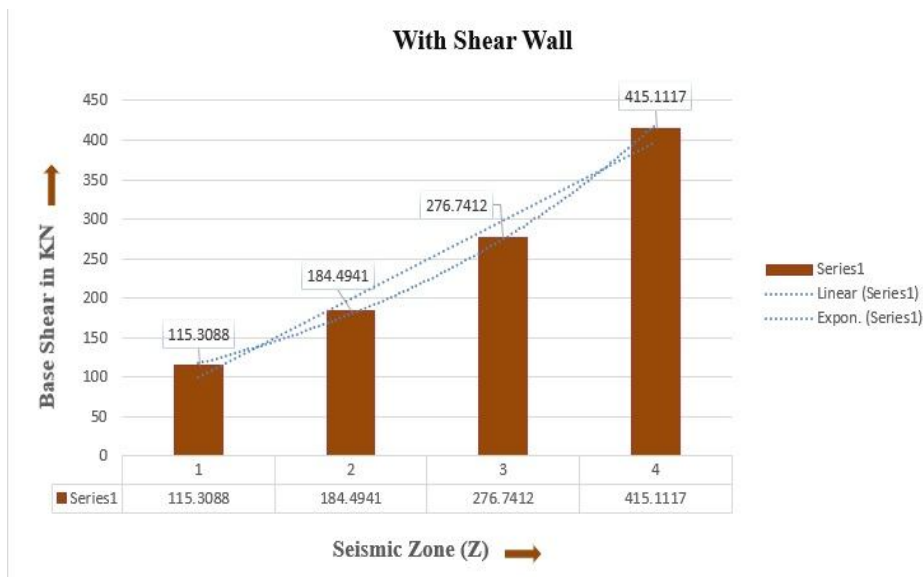
Graph 1: - Base Shear (Story wise) with shear wall