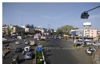
Figure2 Chetak Bridge