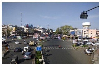
Figure2 Chetak Bridge