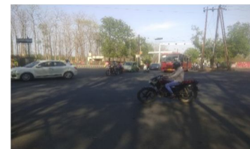
Figure3 Isbt Square