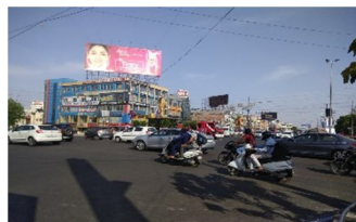
Figure 1 Board Office

To check the validation of the methodology some signalized intersections has to be identified. In the process of identification of signalized intersections it is kept in the mind that we cover the un-signalized intersections having different features. Three un-signalized intersections has been identified viz. (I) Board office Square Bhopal, it is a four lagged un-signalized intersection in Bhopal city of Madhya Pradesh. (II) , Chetak Bridge square Bhopal, it is a four lagged un-signalized intersection in Bhopal city of Madhya Pradesh. (III) ISBT Tiraha, it is a three lagged un-signalized intersection in Bhopal city of Madhya Pradesh. Photograph 4.1, Photograph 4.2, Photograph 4.3 shows the three un-signalized intersections viz. Board office Square, Chetak Bridge square, and ISBT tiraha respectively.