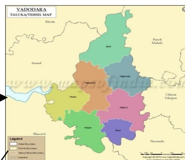
Fig.2 Map of vadodara District