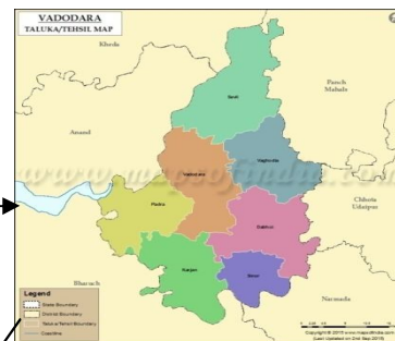
Fig.2 Map of vadodara District