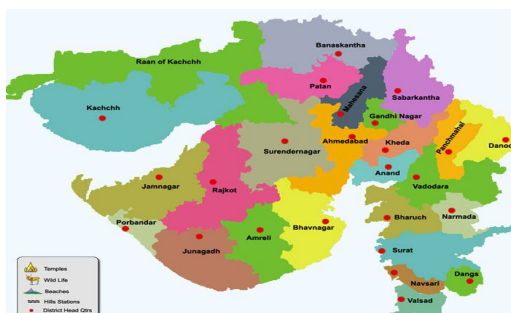
Fig.1 Map of Gujarat State

The study area selected for this study is Padra Taluka of Vadodara district, Gujarat, India. It is located about 16 kilometers from Vadodara city. Padra is located at 22.23°N 73.08°E and it has an average elevation of 79 meters. There are about 83 villages in Padra block.