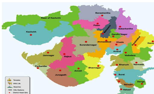
Fig.1 Map of Gujarat State

The study area selected for this study is Padra Taluka of Vadodara district, Gujarat, India. It is located about 16 kilometers from Vadodara city. Padra is located at 22.23°N 73.08°E and it has an average elevation of 79 meters. There are about 83 villages in Padra block.