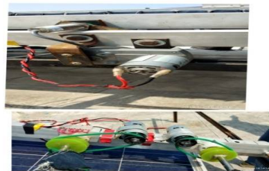
Fig 3: Actual Mechanism