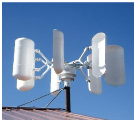
Fig3: Air Foil Design Wind Turbine

The Vertical-Axis Wind Turbine (VAWT) is a wind turbine that has its main rotational axis oriented in the vertical direction. All wind turbines essential work the same way with minor modifications depending on size and configuration. The power in the wind can be computed by using the concepts of kinetics. The wind mill works the principle of converting kinetic energy of the wind to mechanical energy. The wind turns the blades to spin a shaft which connects to a generator which produces electricity.