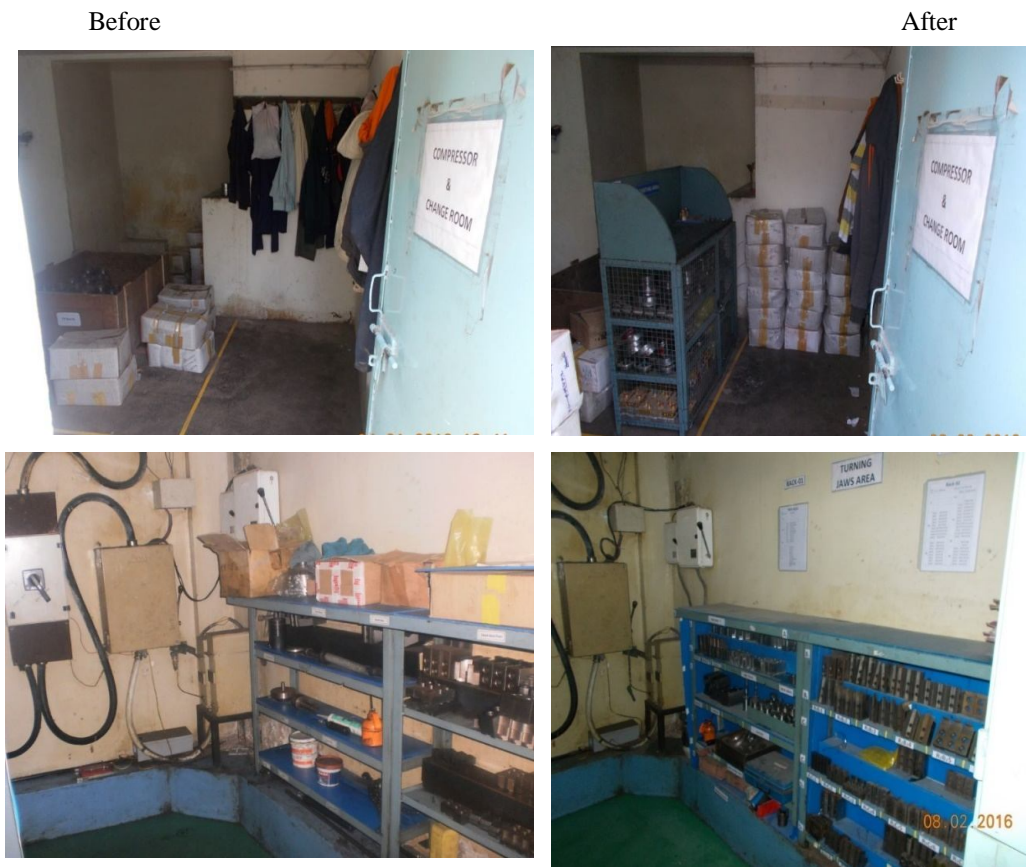
Fig. 1-Implementation of 5S