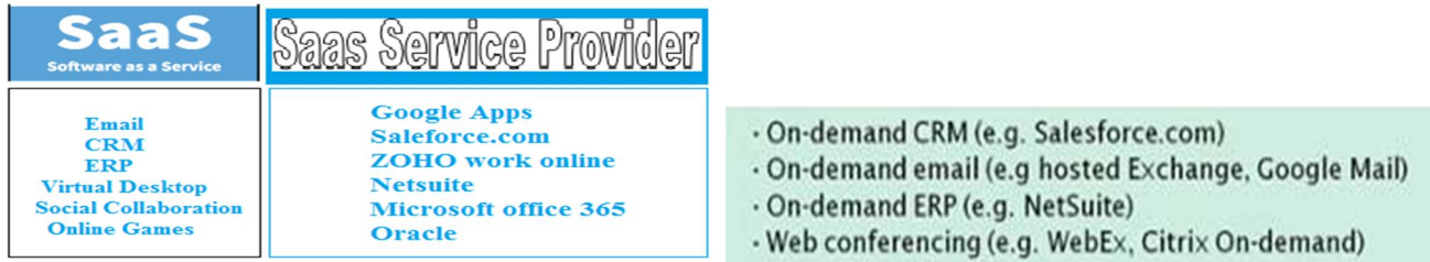
Fig. 5 SaaS Services