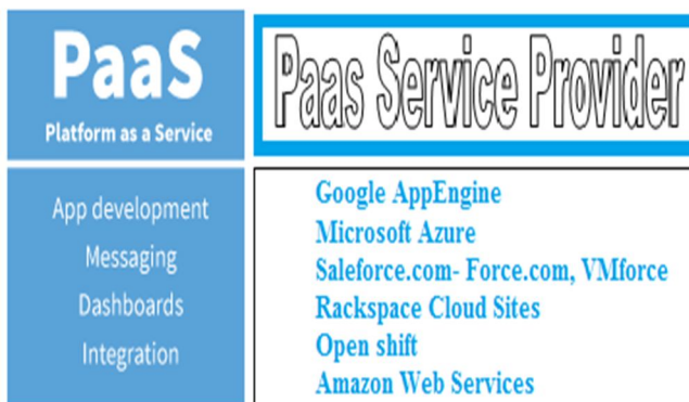
Fig. 4 PaaS Services

C. Software as a Service: SaaS is top most layer of the cloud computing service. In this model, consumers neither need install anything on their personal computer, nor have to pay considerable up-front costs to purchase the software and the required licenses. They simply access the application website, enter their credentials and billing details, and can instantly use the application, which, in most of the cases, can be further customized for their needs. On the provider side, the specific details and features of each customer’s application are maintained in the infrastructure and made available on demand. Software-as-a-Service is a software distribution model in which applications are hosted by a vendor and made available to customers over a network, typically the Internet. The common features of desktop applications—such as office automation, document management, photo editing, and customer relationship management (CRM) software—are duplicates on the provider’s infrastructure and made more scalable and accessible through a web browser on demand and billing done through renting weekly, monthly, yearly and pay-per-use. These applications are shared across multiple users whose interaction is isolated from the other users. Examples are Google drive, social networking site, gmail, etc.