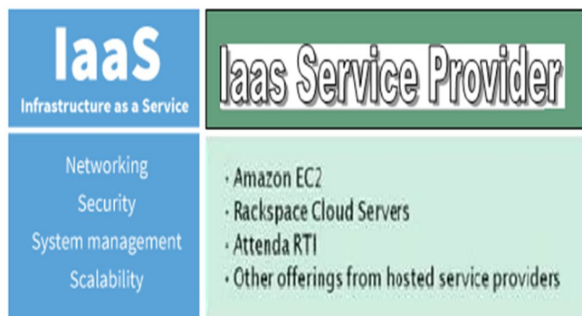
Fig. 3 IaaS Services