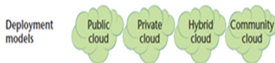
Fig. 1 Cloud Computing Services &amp; Deployment Models