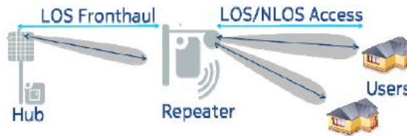
Fig 1. Block diagram of system scenario

Working of this proposed solution is based on this two range of millimeter wave and use of repeater to overcome drawback of millimeter wave. Repeater basically consists of local oscillator which will convert 39 GHz signal to 28 GHz and convert 28 GHz signal to 39 GHz.