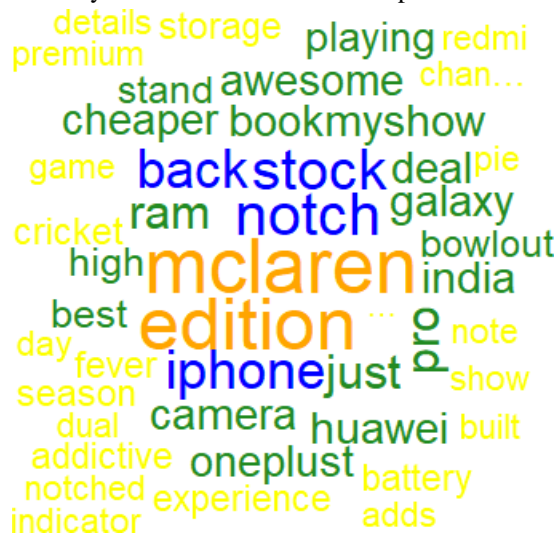
Fig. 2. WordCloud for Sentiment Analysis

The results of the test showed that though some of the customers were not that satisfied with the product but maximum people gave good reviews for the product and that's why our test concluded that the product was hit based on the sentiments of the people.