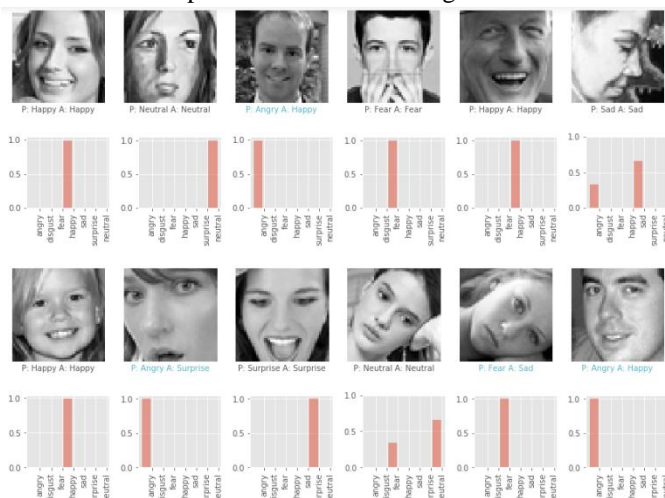
Fig. 2 Representation of various emotions predicted by the proposed system

The proposed system predicts eight different facial expressions as shown in fig 2.