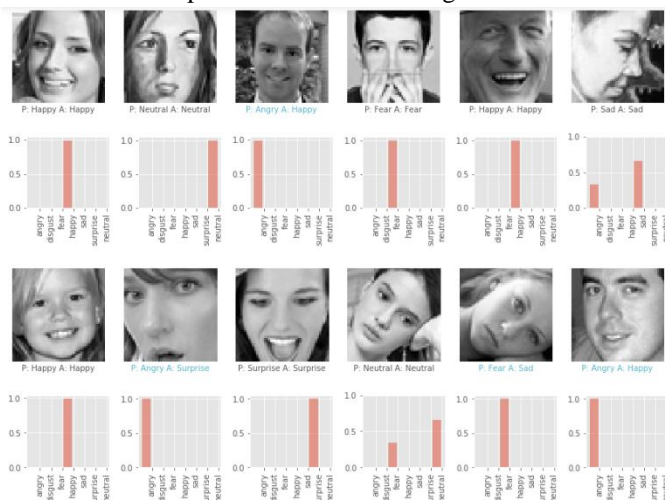
Fig. 2 Representation of various emotions predicted by the proposed system

The proposed system predicts eight different facial expressions as shown in fig 2.