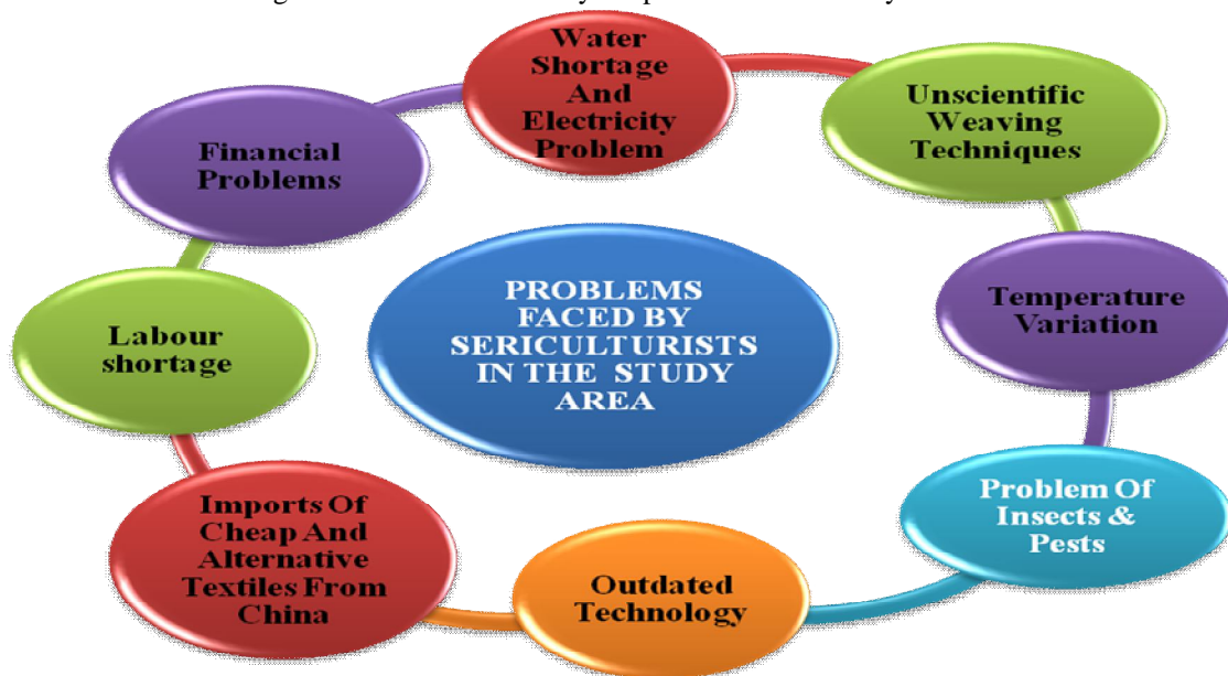
Figure-1- Problems Faced by Respondents in the Study Area

Water shortage and electricity problem, imports of cheap and alternative textiles from china, usage of outdated technology, unscientific weaving techniques, use of poor quality seeds, financial problems, shortage of labour, problems of insects and pests, temperature variation are considered as the major problems in the study area.