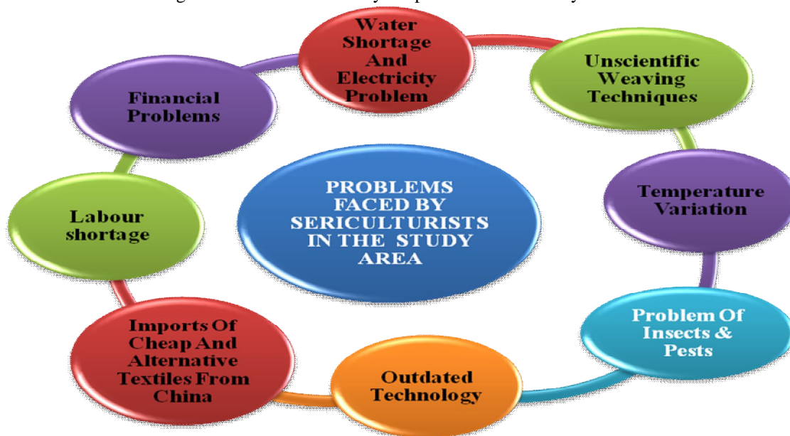
Figure-1- Problems Faced by Respondents in the Study Area

Water shortage and electricity problem, imports of cheap and alternative textiles from china, usage of outdated technology, unscientific weaving techniques, use of poor quality seeds, financial problems, shortage of labour, problems of insects and pests, temperature variation are considered as the major problems in the study area.