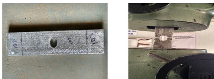
Figure 2: Shows the centre cut-out hole plate before and after fracturing