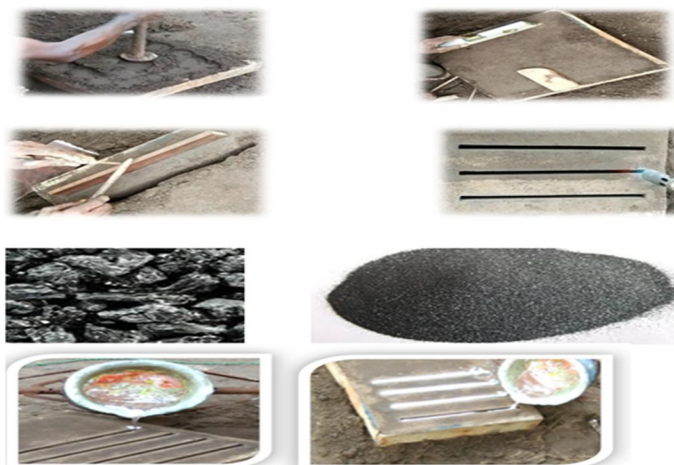
Figure 1: Shows the step by step operations of sand casting method

AA 7075/Sic metal matrix composites are prepared using sand casting method step by step operations are shown in the images. The dimensions of the samples (210*60*10 mm) are fabricated in the sand casting method by varying Sic percentage reinforced with AA7075, after that casting samples are machined in the lathe machines to obtain the required dimensions. The experimental work carrying on Universal testing Machine, the samples images are shown before and after fracturing, the maximum stress are calculated for all the samples of centre/off centre cut-out holes of the plates with varying radius.