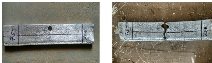
Figure 3: Shows the off centre off cut-out hole plate before and after fracturing