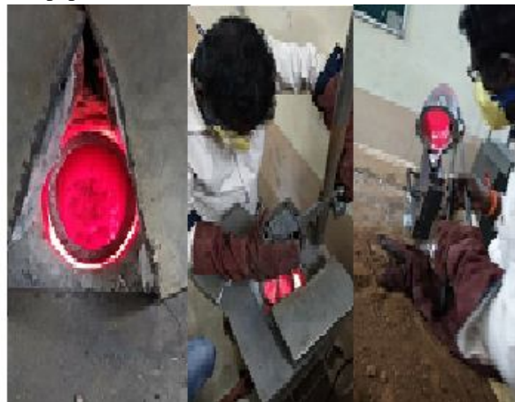
Figure 1. Stirring using Graphite Blade

The present review is on the method employed in stir casting shown Fig 1. The variation in the type of mixing the particulates into the metal matrix has also been dealt with in the paper.