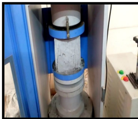
Figure 6: Cube under compressive test

The clause 2.1 of IS 516:1959 specifies the process for manufacture and curing compression test specimen of concrete in the laboratory where exact organize of the quantity of resources and test circumstances are likely and where the most supposed size of aggregate does not go above 38 mm. The system is particularly appropriate to the making of initial compression tests to determine the fittingness of the available resources or to determine suitable mix proportions.