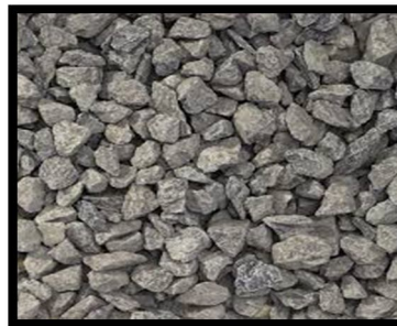
Figure 3: 10 mm & 20 mm Aggregate