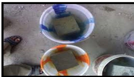
Figure 7: Acid Curing

Durability and strength are two mainly significant criterion for the design of reinforced concrete structures. The cubes after 28 days of curing in water are immersed in 5% HCL of the total volume of water; separately for 14 and 28 days to evaluate the decrement in the strength as compared to normal condition.