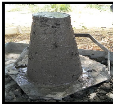
Figure 5: Slump Test

Concrete slump test is to conclude the workability or uniformity of concrete mix organized at the laboratory or the construction site during the improvement of the work. Concrete slump test is accepted out from collection of the consistent value of concrete during construction. Slump is a measure of the consistency of fresh concrete. The slump test is a very simple test. The slump cone is a right circular cone that is 30 cm high. The base of the cone is 20 cm in diameter and the top of the cone is 10 cm in diameter.