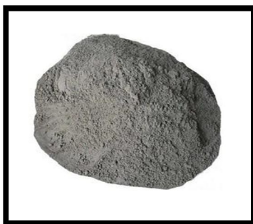
Figure 1: OPC 53 Grade Cement