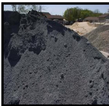
Figure 2: Crush Sand