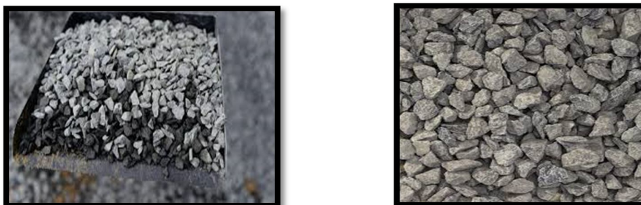
Figure 3: 10 mm & 20 mm Aggregate