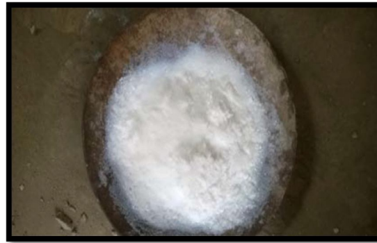
Figure 4: Nano Silica