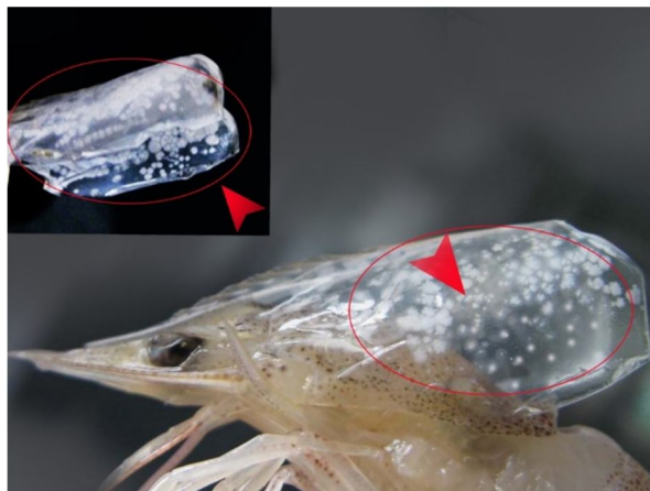
Fig 2: White Spots on carapace of the L.vannamei

All farmed brackish water and marine (penaeid) shrimp species are highly susceptible to white spot virus disease, with mass mortalities commonly reaching 80–100% in ponds within a period of 3–10 days [5,6] . White Spot Syndrome Virus (WSSV) has a wide host range in crustaceans [7,8,9] and is potentially becoming cause to most of the commercially cultivating shrimp species (OIE 2003). Bright milky colour White spots appear on the carapace and other parts of the body. Due to lack of bio-security at the farm, pumping water without disinfection and filtration, cross contamination were observed to be main reasons for the outbreak of WSSV (Fig. 2).