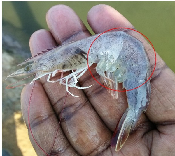
Fig 5: Loose Shell Syndrome (LSS) in L. vannamei .

Loose Shell Syndrome (LSS) was observed in majority of ponds in all the four districts i.e., Guntur, Krishna, West Godavari and East Godavari districts (Fig. 5). Previously studies also reported in the cultured Penaeus monodon since 1998 in India [15] . The affected shrimp are with soft and thin exoskeleton, lethargic in movement, spongy while touch, feed intake was poor and also observed a gap between the muscle and the shell. Moribund, weak shrimp with soft shell swim near dikes of the ponds appear in shiny light pink colour and results in progressive mortality. The mineral deficiency, poor Nutrition and water quality and high loads of pathogenic bacteria and other disease causes of WFS may cause the loose shell syndrome [16,17] .