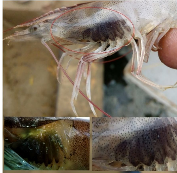
Fig 4: Shrimps infected with black gill disease.

Loose Shell Syndrome (LSS) was observed in majority of ponds in all the four districts i.e., Guntur, Krishna, West Godavari and East Godavari districts (Fig. 5). Previously studies also reported in the cultured Penaeus monodon since 1998 in India [15] . The affected shrimp are with soft and thin exoskeleton, lethargic in movement, spongy while touch, feed intake was poor and also observed a gap between the muscle and the shell. Moribund, weak shrimp with soft shell swim near dikes of the ponds appear in shiny light pink colour and results in progressive mortality. The mineral deficiency, poor Nutrition and water quality and high loads of pathogenic bacteria and other disease causes of WFS may cause the loose shell syndrome [16,17] .