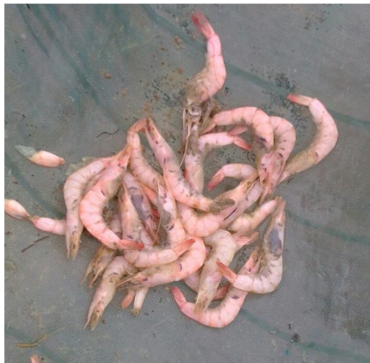
Fig 6: Running Mortality Syndrome in L. vannamei .

Enterocytozoon hepatopenaei (EHP), observed in Mainly in Krishna district, less in Guntur than Krishna district also observed equal in West Godavari and East Godavari district, EHP is a microsporidian caused by parasite to be associated with slow (retarded or stunted) growth and also cause white feces syndrome (WFS) in cultured shrimp in many of the shrimp farms observed in the Guntur, Krishna districts (Fig.7). That the EHP could be detected from slow growing as well as WFS-affected animals [18] . EHP is also reported from slow growing shrimp. Thus, EHP is an emerging problem that is under urgent need of control [19] . It is caused by Microsporidian fungi infected from the soil in hatcheries infected poly chaetes giving as a feed for brood stock.