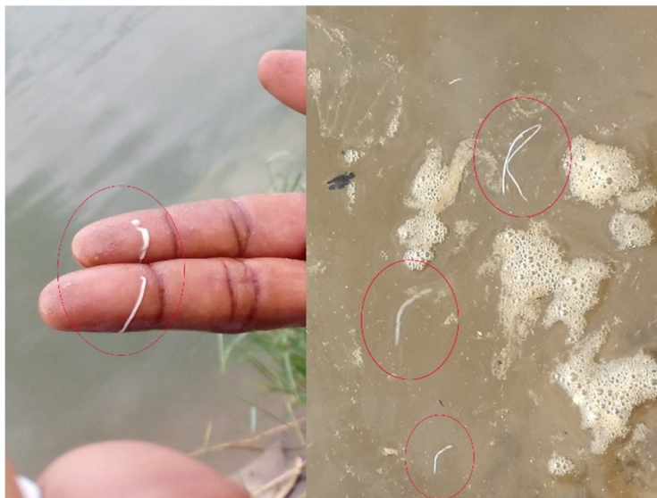
Fig 3: White faecal matter in L. vannamei culture pond.

White Faeces Syndrome (WFS) is observed in all the districts of L. vannamei culture ponds (Fig. 3). Incidences of WFS were observed after 20 days of stocking of the PLs in culture ponds. WFS in shrimp arises with protozoan Gregarines and Hepatopancreas infection caused by the high vibrio sps. Bacteria the Lipid cells leaching into the gut. White faecal material float on the water surface in the culture ponds. Observed Vibrio species have been found in the pond water and fecal analysis from infected shrimps [11, 12] .