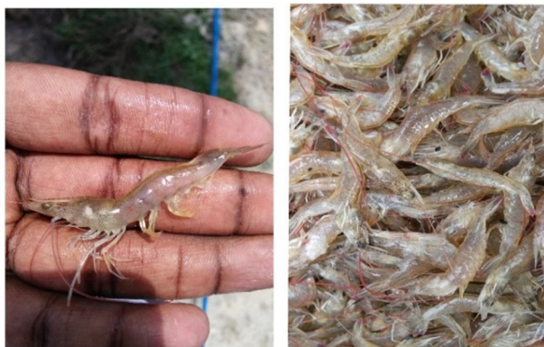
Fig 7: EHP infected shrimp L. vannamei stock.

Enterocytozoon hepatopenaei (EHP), observed in Mainly in Krishna district, less in Guntur than Krishna district also observed equal in West Godavari and East Godavari district, EHP is a microsporidian caused by parasite to be associated with slow (retarded or stunted) growth and also cause white feces syndrome (WFS) in cultured shrimp in many of the shrimp farms observed in the Guntur, Krishna districts (Fig.7). That the EHP could be detected from slow growing as well as WFS-affected animals [18] . EHP is also reported from slow growing shrimp. Thus, EHP is an emerging problem that is under urgent need of control [19] . It is caused by Microsporidian fungi infected from the soil in hatcheries infected poly chaetes giving as a feed for brood stock.