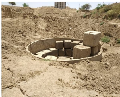
Fig 4 False Steining

The afflux effect can be neutralized by providing, false Steining with thickness of 300 mm and 4 m height which can be dismantled at the designed top level of the well cap.