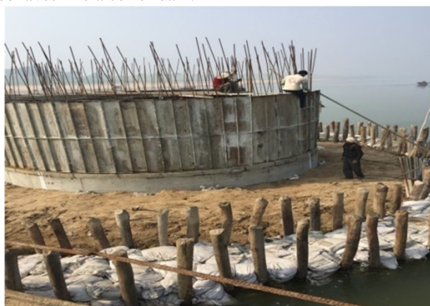
Fig 3 False Steining

1) The Construction of False Steining: The deep foundations where low water pressure exists, the false Steining is constructed to counteract the artesian pressure. This is the solution which protects the bridge structures over entire service period. The local artesian head is relieved by the construction of false Steining and this requires expert technical workforce. The wooden piles are provided below at 300 mm/cc spacing. This results into water tight surroundings and thus responsible for the stability of the soil. . The platform is constructed with double the diameter of the well and piles are driven along the boundary and sand bags are placed between the piles. This behaves like a coffer dam.