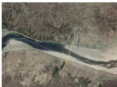
Fig 2 Vicinity Map

The proposed scaffold is crosswise over waterway Chambal is in Ater Jaitpur Road, Madhya Pradesh and Uttar Pradesh outskirts, India. In this locale the waterway run practically parallel to the two states. It is on the state thruway SH-2 Bhind-Ater-Porsa and 25 km away from Bhind. Fig 2 present a maps demonstrating span arrangement.