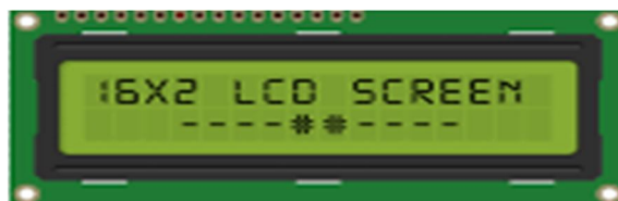
Fig. 3 LCD

Here, the LCD is used to specify whether the data is send to consumer's/organization registration mobile number on particular time or not and to completion of computer need to run system.