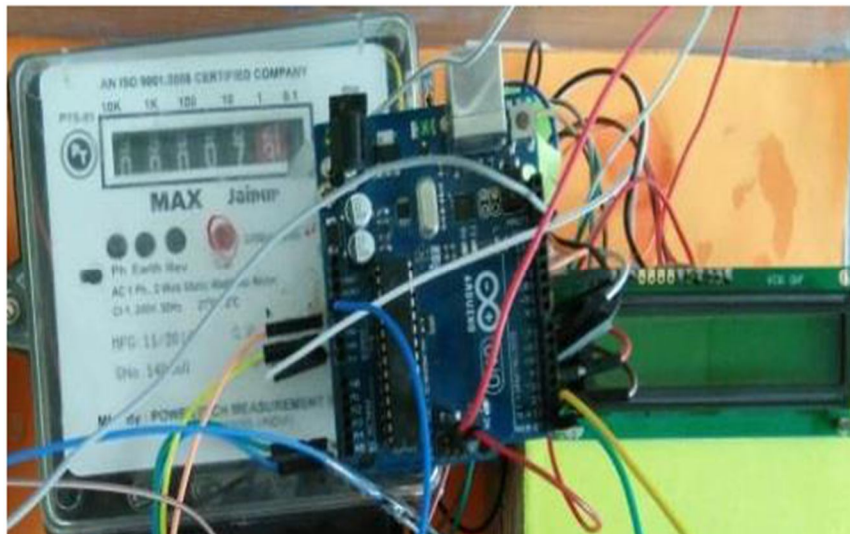
Fig. 2 Energy Meter Execution With, LCD and Arduino

We have connected fixed load of 900 Watts (set of bulbs) to determine the unit consumption and transferred pulses to Arduino from meter through Optocoupler arrangement.