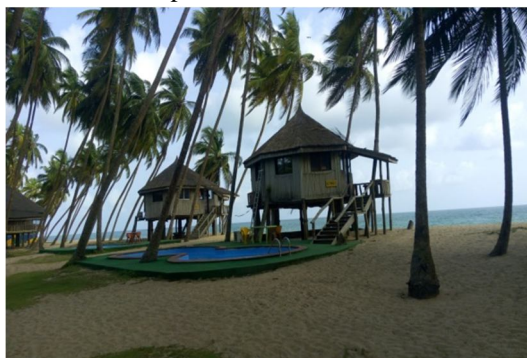
Plate 1:Showing charlet building and swimming pool of La Campagne Tropicana beach resort

La Campagne Tropicana Beach Resort is a luxurious hotel and beach resort which mixes Nigeria traditional culture with modern ones; and thus offers a unique blend of natural environments which include a fresh water lake, accessible mangrove forest, a savannah, extensive sandy beach and the warm Atlantic sea; also the resort combine palm trees of differs strand mixes with soft and hard landscape for the landscape and aesthetic of the environment.