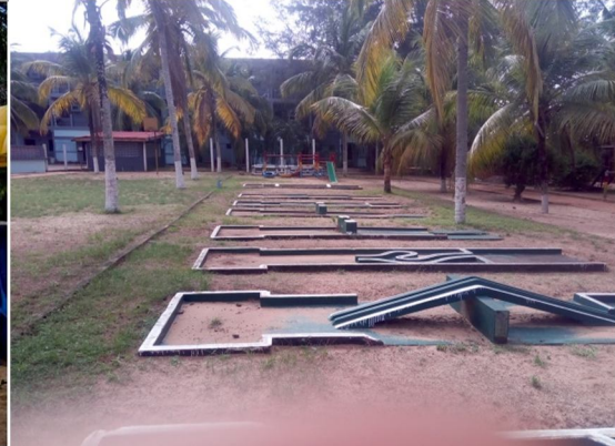
Plate 2: Showing Children playing ground