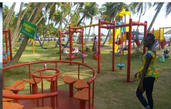
Plate 2: Showing Children playing ground of La Campagne Tropicana beach resort