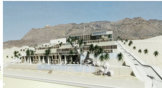
Plate 5. : Showing the Hotel View of Dead sea