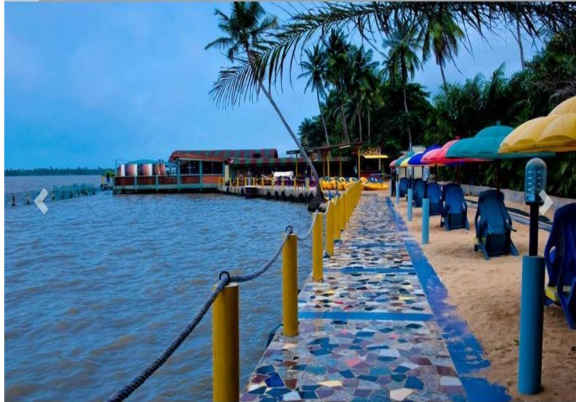
Plate 1: Showing beach relaxation arena of

The resort caters for series of activities and events such as Themed event, Concert, Trade Show, Honey moon, picnic, sporting activities etc. The landscape design of the environment is made up of organic architecture with the soft and hard landscape, the soft landscape include trees and ground covers while the hard landscape used are tiled flooring, interlocking paving and concrete paving.