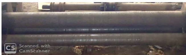
Fig. 3. Rollers

The entire process of metal sheet rolling is divided into three step: