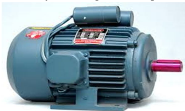
Fig. 2. Motor