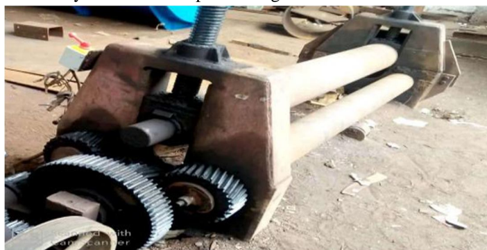
Fig. 1. Sheet Rolling Machine

The paper also contain how hollow cylinder formed there design and analysis procedure. The sheet rolling process is play important role in manufacturing industry, and there for it's a large growing industrial area. This sheet metal are used to forming a hollow cylinder which is used in many industries such as Power Plants, Automobile sector and many more. Sheet fabrication ranges from Stamping, forming, drawing, High-Energy-Rate-Forming (HERF) to obtained desire shape. Fascinating shape may be bend from a single plane sheet of material without tearing or cutting, stretching, if incorporates one curved bend into the design. The sheet rolling is the process of bending continually of sheet metal piece along a linear axis.