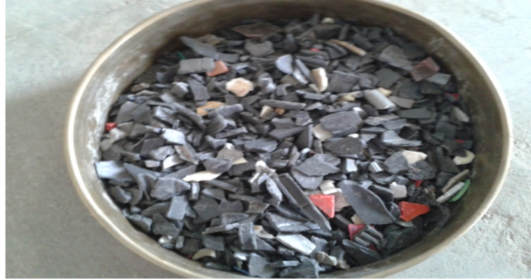
Fig 1 HDPE

plastic were used in concrete to improve the properties of the concrete and reduce cost. By using these plastic wastes in concrete its will lead to sustain the concrete design and greener the environments.