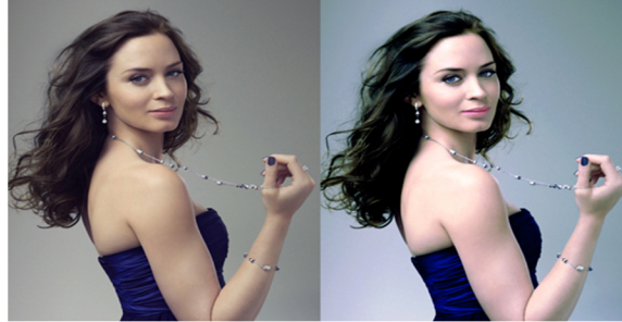
Fig 1.2: Image Enhancement

Image enhancement encompasses the processes of altering images, whether they are digital photographs, traditional photochemical photographs.