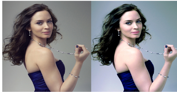
Fig 1.2: Image Enhancement

Image enhancement encompasses the processes of altering images, whether they are digital photographs, traditional photochemical photographs.