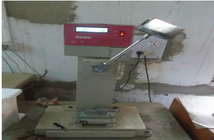
Fig- 3. Experimental set up for Impact Test Machine

The Charpy impact test, also known as the Charpy V-notch test, is a standardized high strain-rate test which determines the amount of energy absorbed by a material during fracture. This absorbed energy is a measure of toughness of specimen materials and acts as a tool for study temperature-dependent ductile-brittle transition. It is widely applied in industry, since it is easy to conduct and results can be obtained quickly. A major disadvantage is that results are comparative. The apparatus consists of a pendulum (hammer) swinging at a notched specimen. The energy transferred to the material can be inferred by comparing the difference in the height of the hammer before and after the impact. The notch in the specimen and size of the specimen affects the results of the impact test. Thus it is necessary for the notch to be of regular dimensions and geometry. Since the dimensions determine whether or not the materials in plane strain. Impact strength = E/t \times 1000 , 'E' - Energy used to break (J), 't' - Thickness in mm