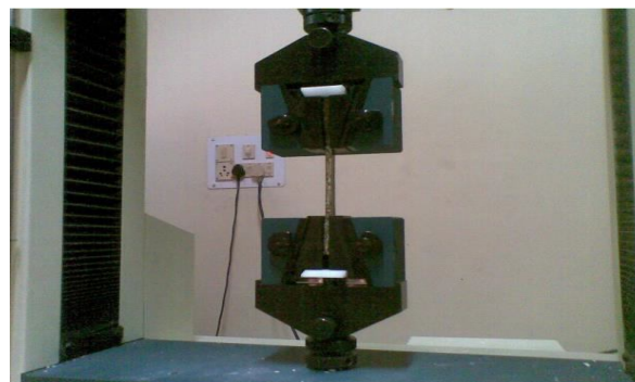
Fig-2: Experimental set up for Tensile Test machine

The ability to resist failure under tensile stress is one of the most important and widely measured properties of materials used in structural applications. The force per unit area in MPa, required to break a material in such a manner is the ultimate tensile strength or tensile strength. Tensile properties indicate how the material will react to forces being applied in tension. A tensile test is a fundamental mechanical test, where a carefully prepared specimen is loaded in a very controlled manner, measure the applied load in various zone, the elongation of the specimen or changing in length and changing in area. Tensile tests are used to determine the modulus of elasticity, elastic limit, elongation, proportional limit, and reduction in area, tensile strength, yield point, yield strength and other tensile properties.