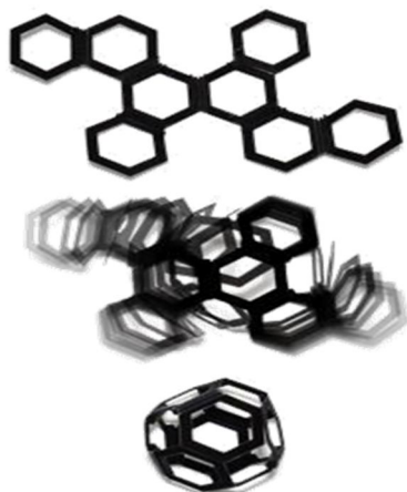
Fig 4 Curved-Crease Origami ([14])