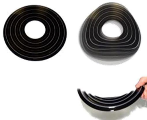
Fig 3 Self-Folding Truncated Octahedron ([14])

In his research, Skyler Tibbits demonstrated custom angle transformation creating trun-cated octahedron shape. Similar mechanism as folding strand described previously, series of flat two dimensional structures were generated with edge joints. The position and spac-ing of materials at each joint specifies the desired fold angle hence positioned accord-ingly. In such case, folding accuracy can be monitored with the help of code producing custom angle joints and accommodation of date from calibration test. After the digital model was sent to be printed, physical model was immersed in water. The transformation process occurred within certain time with the final desired model having edges aligned perfectly aligned with neighboring edges. With this technique, a two dimensional poly-hedral shape was folded and self-transformed into precise three dimensional structure..[2]