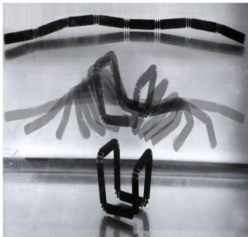
Fig 2 Self-Folding Strand

For any bending or folding structure, joint plays important role as controlling of joints adjusts the desired shape of structure.