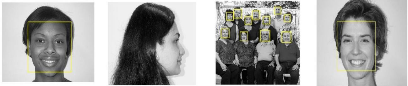
Fig.4. Some outputs of face detection method based on Viola Jones Algorithm

Following are some experimental results.