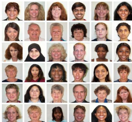
Fig.3. Some examples of Database

We have used “Minear, M. & Park, D.C. (2004). A lifespan database of adult facial stimuli. Behavior Research Methods, Instruments, & Computers, 36, 630-633” database and some other database. Minear, M. & Park, D.C database consist of more than 300 individual faces ranging from ages 18 to 93. It has faces of 218 adults age 18–29, 76 adults age 30–49, 123 adults age 50–69, and 158 adults age 70 and older [11].