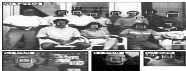
Fig.6. Output of RCNN system[16]