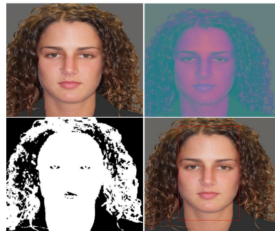
Fig.3.Results of YCbCr color space based face detection method