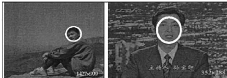
Fig.2. Face detection output of images with complex background