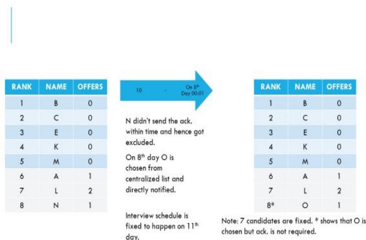
Fig. 4 Way to Final List Formation 3