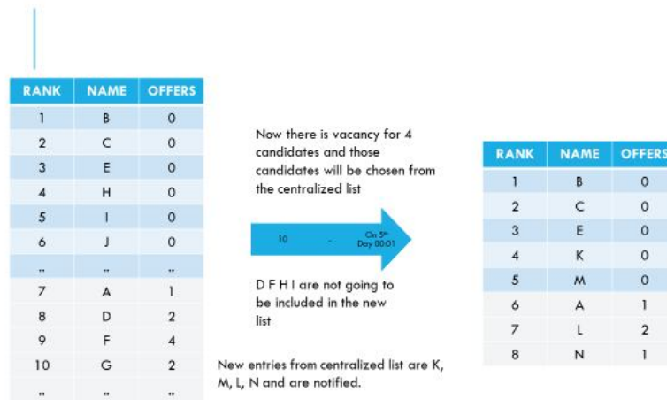
Fig. 3 Way to Final List Formation 2